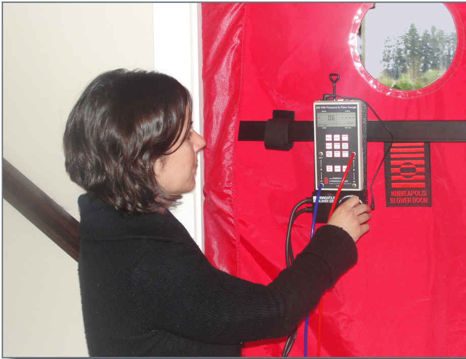
An air sealing test is now required in Washington state.

Reinvestment Act allocated funds to the State of Washington, the Washington State Legislature created the Community Energy Efficiency Pilot Program . The WSU Extension Energy Program was designated to oversee this program.