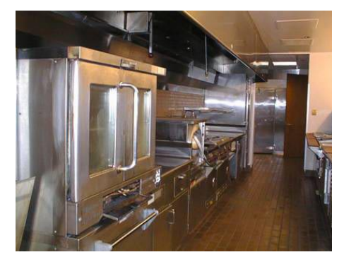
An entire kitchen was deconstructed by members, transported to the School for the Deaf in Vancouver by other members, and hooked up with the assistance of yet another group of members.

For more information on Venture Management, please contact Consortium staff in Olympia at (360) 956-2057 or email us at bobmac@energy.wsu.edu. 🛠