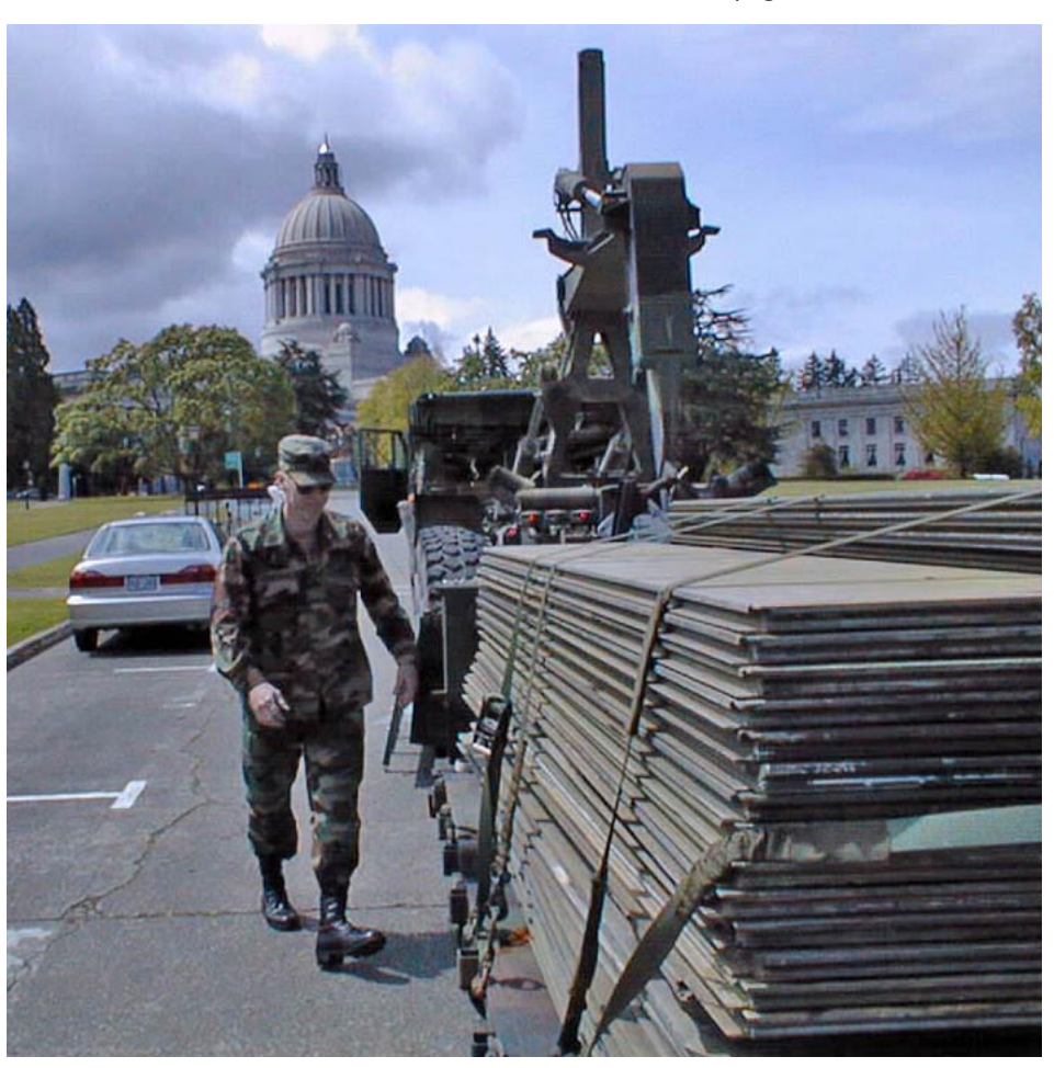
A Washington National Guard soldier inspects his load of palletized platform materials donated by a federal agency partner for use by Washington State Department of Veterans Affairs. The Consortium managed the entire process.