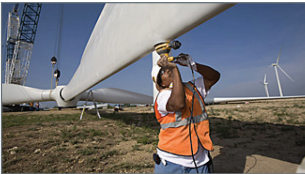
WSU Energy Program staff have assisted in developing and preparing a clean energy workforce.

The Washington State University (WSU) Energy Program is a self-supported department within the University. Operating much like a consulting firm, we provide expert technical assistance to help our customers address energy challenges.