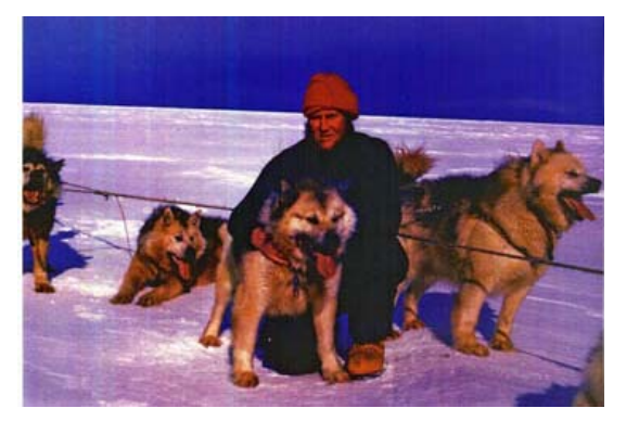
Bitters dog sledding near Deception Island, Antarctic Peninsula, Antarctica. Spring 1972.

In support of the US Navy Arctic Submarine Tracking Operation in Spring 1985, Bitters gets ready to deploy his parachute to land at the surveillance station at the geographic North Pole.