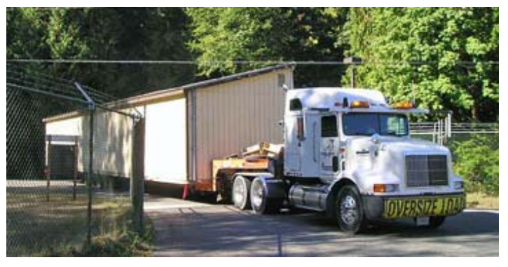
The Evergreen State College leveraged Consortium re-use offerings with the procurement of two used modular build-ings in Fall 2006. Savings to the college exceeded $75,000.

Renewal rates remain stable . We remain convinced that the health of the self-sustaining POS program is gauged by the re-