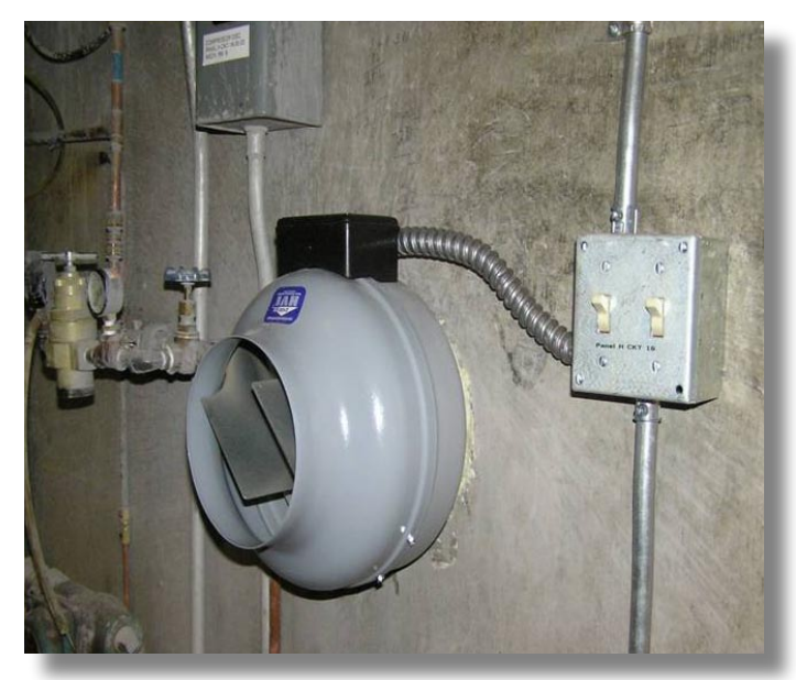
Exhaust fan in tunnel maintains "clean to dirty" air flow, preventing exposures to occupants in classrooms above.