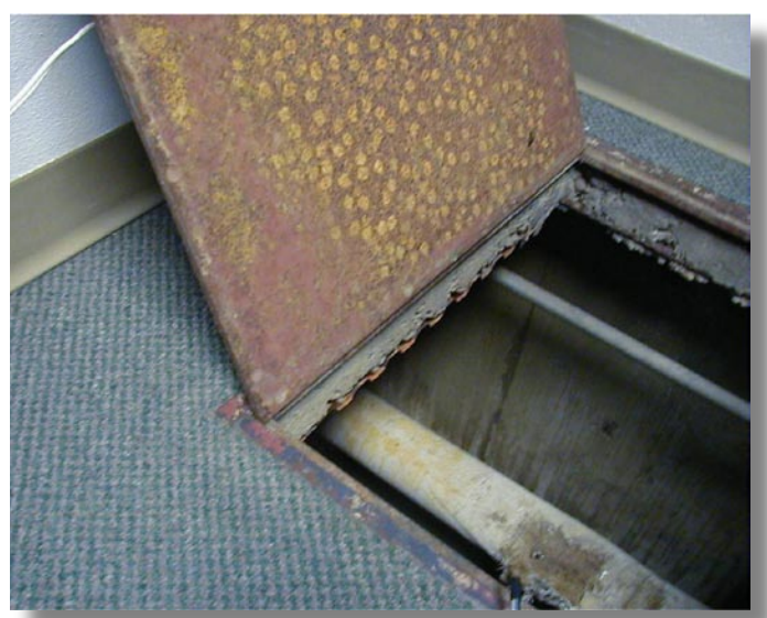
Keep tunnels, crawlspaces, and other areas containing contaminants under negative pressure compared to occupied.

Left: Other potential indoor air contaminants in these areas can include radon, pesticides, rodents, insects, molds, soil gas, moisture, and other pollutants.