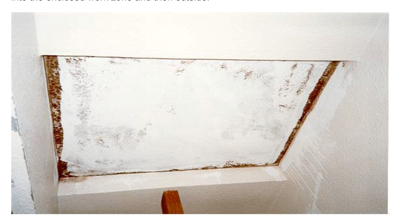
Figure 13. Drywall covered with mold needs to be carefully removed. Painting over mold is not acceptable work practice.

Cleanup of incidental mold growth may be a simple matter of misting the mold with soapy water and washing it off a surface. However, extensive mold growth, like a slow leak in a wall cavity involving several square feet of mold growth, usually requires workers who are trained to erect plastic sheeted enclosures around the work area to prevent release of mold to contaminate the whole rental. In addition, exhaust fans should be used to "depressurize" the work zone so airflow moves from the clean rental into the enclosed work zone and then outside.