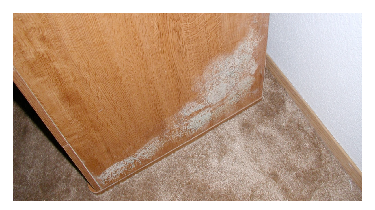
Figure 3. Mold growth caused by condensation on the cool cabinet placed against an exterior wall in a rental unit. The excessive indoor relative humidity (regularly exceeding 60%) was the culprit. This surface can be cleaned with soapy water.