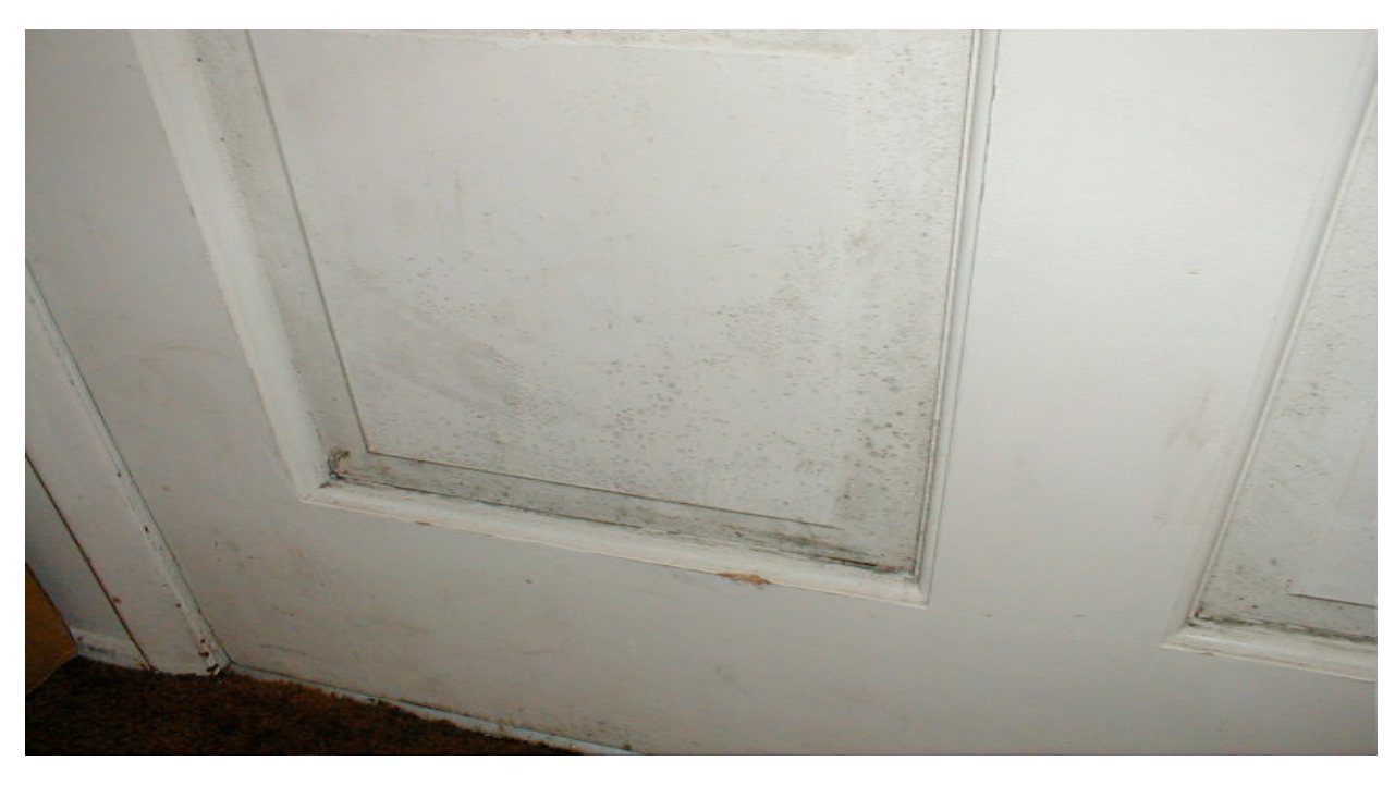
Figure 6. Condensation: Mold growth on inside surface of exterior door. Again, cold surface meets moist air, gets wet and supports mold growth. This can be washed off and repainted.