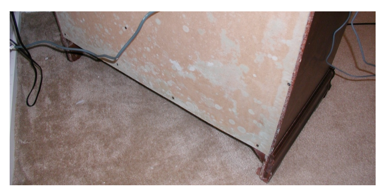
Figure 4. Condensation: Tenants kept the apartment at 60 degrees, cold enough that the back side of their dresser was below "dew point", the temperature at which typical moisture levels in the air will condense on a surface. With the dresser chronically wet, mold got started and amplified. This can probably be scrubbed off (outside!) and painted. To prevent a recurrance of the mold, surfaces need to be kept warmer either by increasing the apartment temperature and/or allowing air circulation behind the dresser, or lowering the relative humidity in this space.