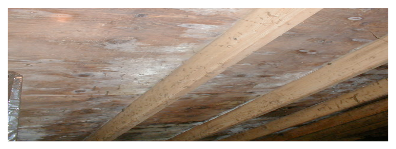
Figure 8. Condensation: Mold growing on roof "sheathing" in an attic. In winter months, moisture (water vapor) leaking through the ceiling of the living area with the force of warm air rising will condense on the cold attic sheathing, causing property damage and mold exposure to occupants. Left uncorrected, the roof will fail and need replacement.

Standing water in a crawlspace under a building is nothing but trouble for landlords and tenants. This water is constantly evaporating, adding unplanned moisture to the air upstairs in the living area, making it that much more difficult to keep relative humidity under control. When a crawlspace is as wet as Figure 7, this evaporative water vapor often passes through the house with the force of warm air rising until it reaches the cold underside of roof sheathing and condenses, leading to attic mold growth (Figure 8).