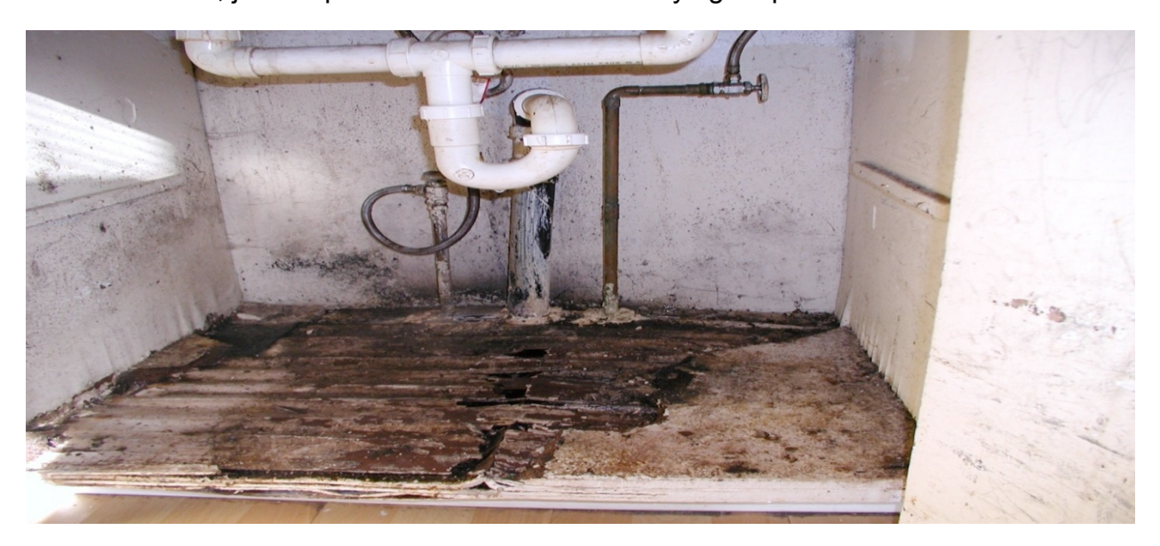
Figure 9. Plumbing leak: Prompt communication with a landlord could have prevented this damage.

landlord of a leak, the less likely surfaces will stay wet long enough to grow mold. Mold can get started in a couple days, so, you know, don't delay. We won't discuss fixing the source of leaks; just emphasize the hazards of delaying response to leaks.