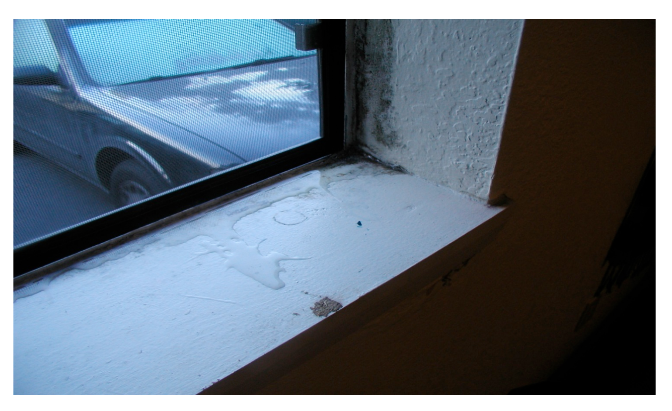
Figure 1. Condensation from excessive indoor moisture on the window glass drained and ponded on the window sill, soaked into and wicked up the drywall, and provided plenty of moisture to cause the black mold growth visible next to the window.

A mold problem always starts as an excess moisture problem. When mold appears, concerned tenants and landlords often "discuss" who is at fault, who should clean it up and how the cleanup should be done. Responsibility for mold growth usually depends on the cause of excess moisture.