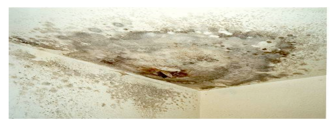
Figure 10. Leak from roof or plumbing: Left unrepaired, a small leak can become a big problem. This wallboard must be removed using personal protection and a plastic enclosure under negative pressure exhausted to outside to prevent further contamination of occupant property. The ceiling and wall cavities will also be moldy and need careful cleaning by protected workers.

A very common mistake made by landlords even after successfully stopping a leak is failing to fully realize the scope of the resulting moisture penetration into building materials (Figure 11). Typically, drywall, carpet, padding, and subfloors get wet from a bad leak. These materials must be aggressively dried to prevent mold growth, sometimes requiring professional assistance. Carpets may need to be lifted to rapidly dry the carpet, pad, and floor boards using dehumidifiers and fans. Drywall may need some holes drilled through it to get dehumidified air into the wall cavities to get things