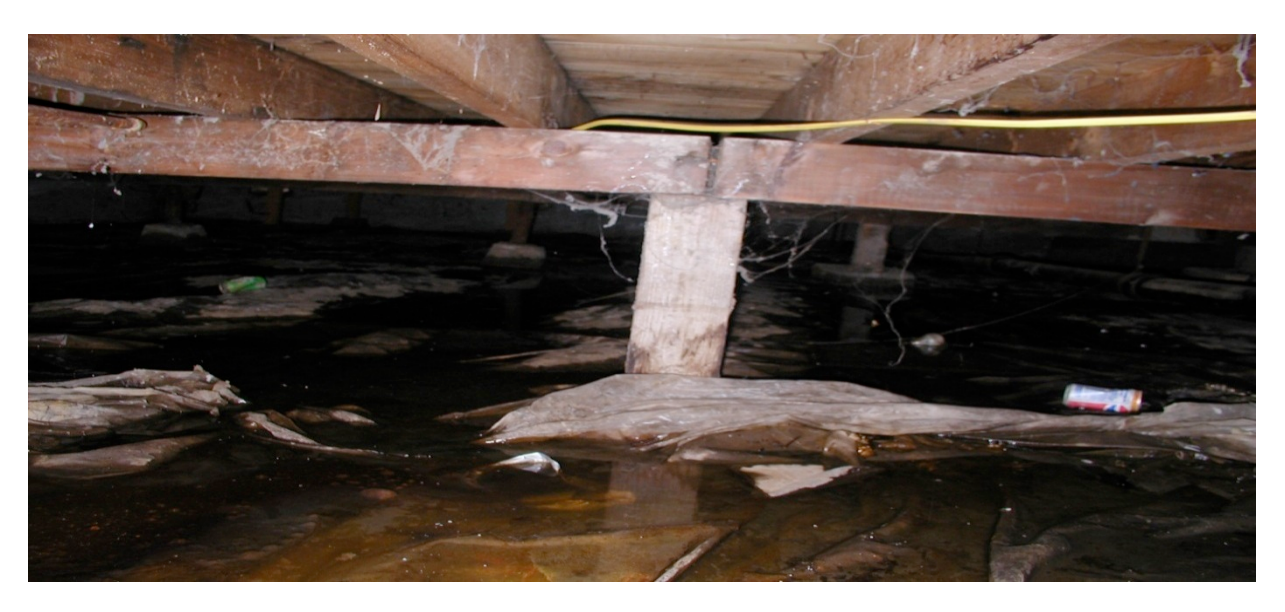
Figure 7. Standing water in a crawlspace: 40 percent of the air you breathe can come from the crawlspace, pulled up by the force of warm air rising. Excess crawlspace moisture is bad for your health, bad for the structure, and a significant factor driving relative humidity UP upstairs.

Standing water in a crawlspace under a building is nothing but trouble for landlords and tenants. This water is constantly evaporating, adding unplanned moisture to the air upstairs in the living area, making it that much more difficult to keep relative humidity under control. When a crawlspace is as wet as Figure 7, this evaporative water vapor often passes through the house with the force of warm air rising until it reaches the cold underside of roof sheathing and condenses, leading to attic mold growth (Figure 8).