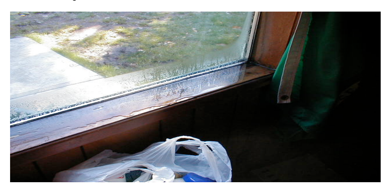
Figure 2. Too much moisture in the air (high relative humidity) leads to unwanted condensation on cool surfaces like double pane windows in cold weather. The moisture drips down, accumulates on sills, and can leak into wall cavities below causing hidden mold growth on wood and paper backed wallboard. Single pane windows will be colder still, resulting in condensation even with normal indoor humidity levels (below 40%) and may require daily drying of sills with towels to prevent mold growth and water damage.

In the first two cases with actual water leaks, it still falls on the tenant to promptly notify the landlord, preferably in writing, that water is leaking into the unit. The tenant is doing the landlord a favor, trying to prevent damage to the structure, while at the same time defending his or her own health against exposure to the mold that WILL result from leaks that are ignored or fixed too late.