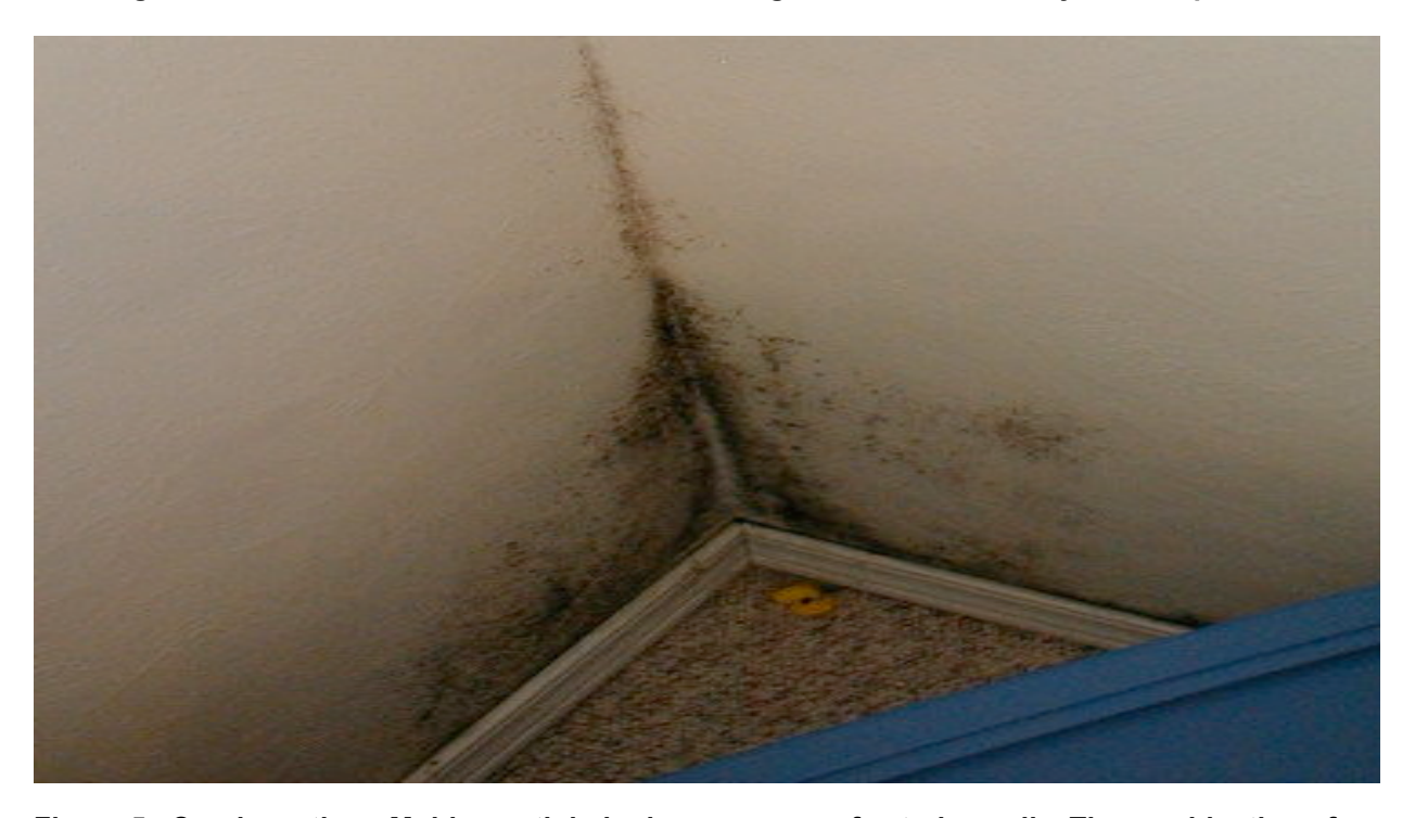
Figure 5. Condensation: Mold growth in bedroom corner of exterior wall. The combination of high relative humidity from occupants breathing all night (exhaling water vapor) and the cool surfaces of the exterior wall led to condensation and mold growth.