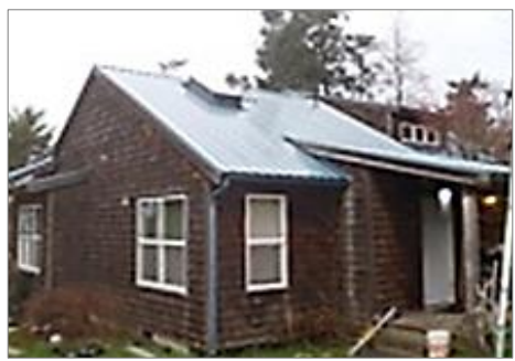
Home in need of energy efficiency upgrades in a LCLT neighborhood